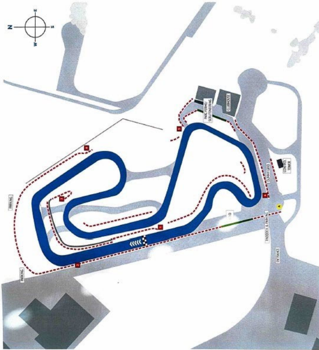
Figure 1: Non-Gearbox Track Layout